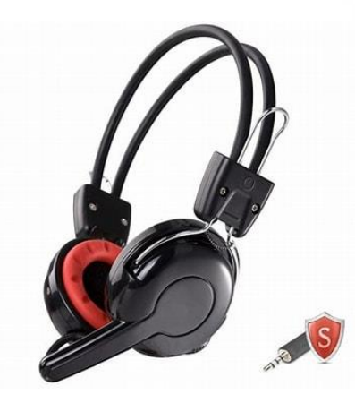
Little Sun over-ear headphones with microphone