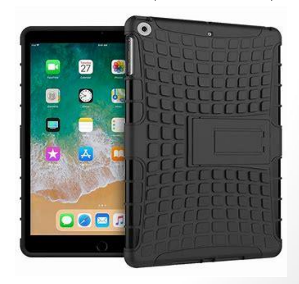
Example of an appropriate case